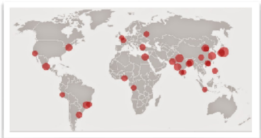
Map of all megacities today marked by red points

A megacity is a very large city, typically with a total population in excess of 10 million people. Often a large part of the national gross domestic product is produced in megacities.